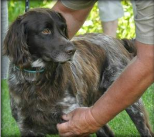
Brushdale's All Gun's Blazing

In November 2014, 11 puppies were born, sired by our male Angus with Castiron's C Bella. This was Angus's first litter and Bella's second. Both Angus and Bella are stellar hunter/trackers and have scored high on their NA field tests (Prize I).