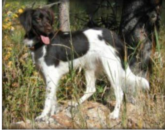
Castiron's C Bella (Bella)

Born: 9/28/2010 Reg #: 10092803 KIM Color: Roan Height: 20 3/8"/51.75 cm Length: 22.5"/57 cm Weight: 54 lbs Coat: Dense, Soft NA: 110 Prize I N-4 S-4 W-4 P-4 T-3 D-4 C-4 OFA: SMU-141G36M-NOPI (Good) SMCNA 2013 Bird Derby 3rd place Sire: Charly von Sandloh HZP 183, VGP 331 Pr I, HD-A HQ=0.99 Roan Dam:Gosch's Kathryn Die Jagerin NA 103 II, SMU-96G25f-NOPI Brown/White